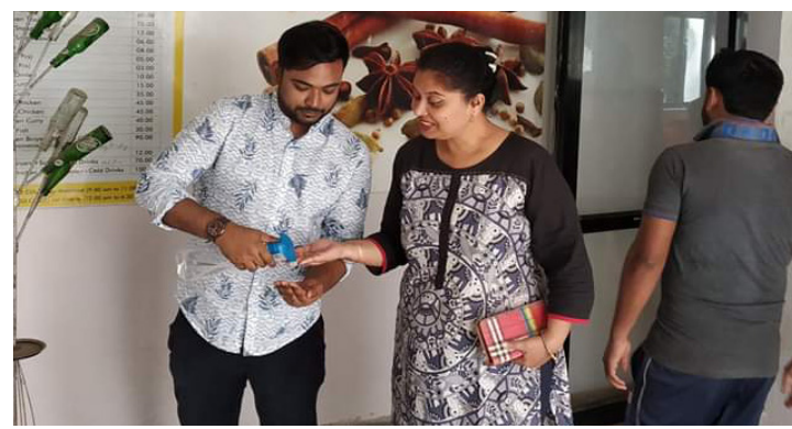
Staffs of Brainware taking preventive measures.

We have witnessed many disasters earlier. Now we all are undergoing another critical phase. But with a positive hope to experience a new sunshine, we all know that we will overcome this adversity. Now the question arises how? Many of us have no basic idea of the unseen virus surrounded and spreading vigorously like the 'Zombie World', where touching is a lethal weapon. Therefore the answer lies in maintaining 'Safe Distance'. In such a situation Brainware University is very concerned about the members, the students, the campus, that are considered as the pillars of the Brainware